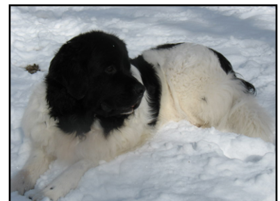
Makai enjoying the recent snowfall.